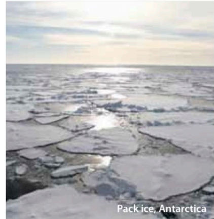
Pack ice, Antarctica