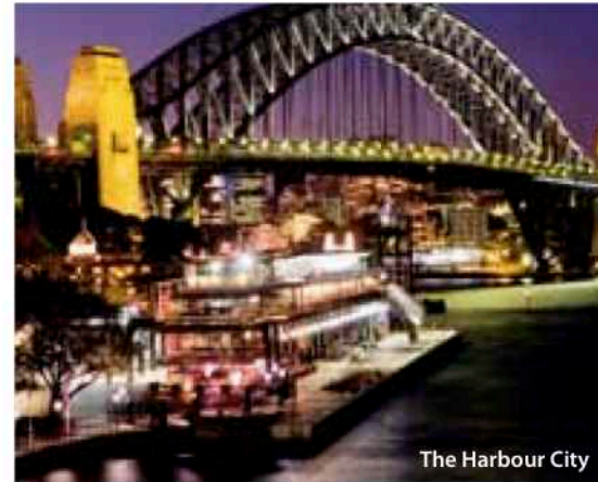
The Harbour City

"Port Botany would offer fast and efficient processing of our guests and stores with better transport access than can be provided in the Garden Island or Circular Quay areas, with convenient access to the airport."