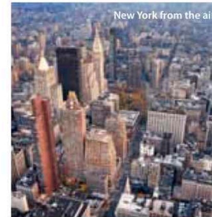
New York from the air